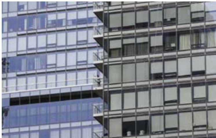
Toronto real estate is vulnerable to money laundering

Bosley Real Estate Ltd. is a full service boutique brokerage operating in Toronto, Niagara-on-the-Lake, Port Hope and Cambridge Ontario since 1928. We have four centrally located offices and over 250 sales representatives selling and leasing homes and condominiums in all the vibrant communities we work in. Our brand is well recognized internationally thanks to our unique affiliation with Leading Real Estate Companies of the World. Our sales teams meet weekly to discuss market conditions, trending topics, and anecdotes that more accurately reflect the true temperature of the real estate market.