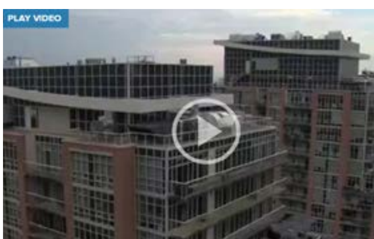
Will it crash? Here's what to expect from the Canadian housing market in 2019

“After a screeching halt sometimes comes a crash. This was the year when Canada’s housing market hit the brakes. So what will happen in 2019?”