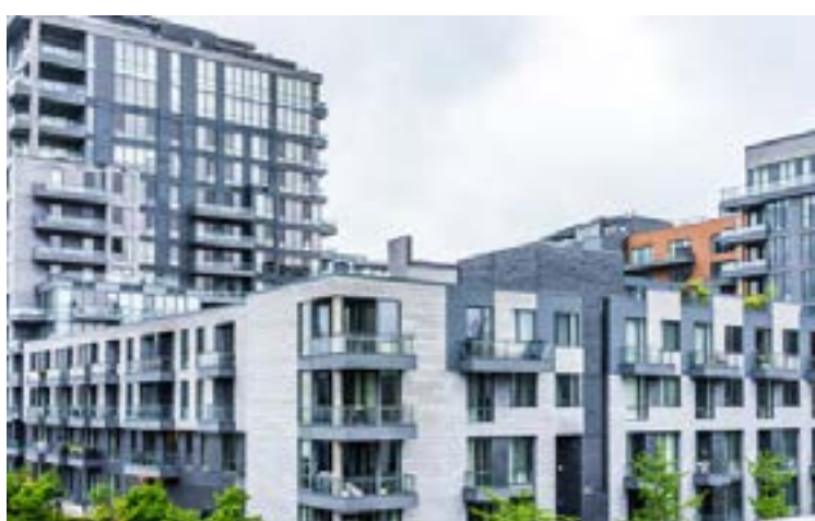
Rental Housing Market Grows Tighter As Demand Outstrips Supply, CMHC Says

“Canada’s overall vacancy rate dropped for a second year in a row, as demand for rental housing grew at a faster pace than supply, according to the Canada Mortgage Housing Corp.”