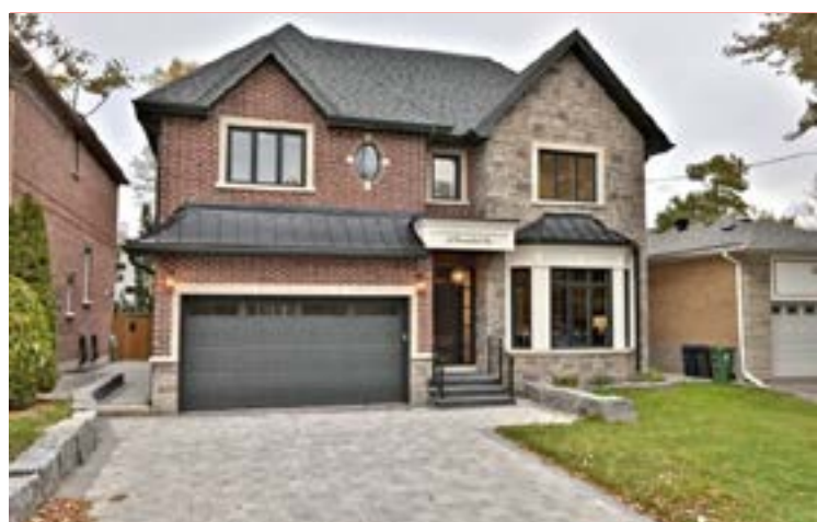
Toronto home sellers should abandon lofty expectations, high end realtor says